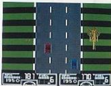
Catch a bird's-eye view of the close race from the Absolute Helicam!

Racers Tip: The Helicam screen is a prime place to gain a good lead. Try forcing your opponent into oncoming traffic as you take the position. Don't worry, he won't wipe out—the Helicam will only show him doing so. But if you just work for passing him here, he'll stay right on your tail!